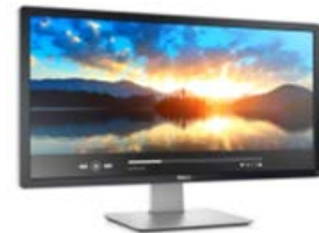
Dell 27 Monitor - P2714H

www.dell.com/support/home/us/en/19/product-support/product/dell-p2714h/manuals